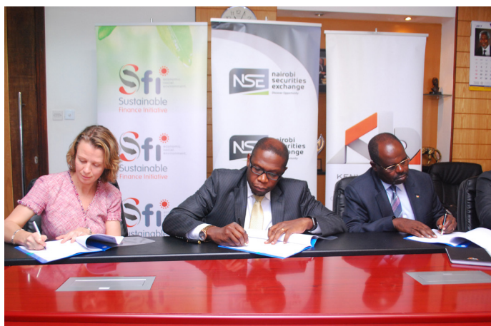
Photo from the launch of the Green Bonds Programme Kenya held at the Hilton Hotel, Nairobi, on 31 st March 2017

Lion's Head has proposed an on-balance sheet financing structure for a pool of banks. In this structure, banks will identify green assets that adhere to established green standards and pledge them as collateral in return for financing from the proceeds of a green bond issued by the SPV. Despite the interest rate cap (discussed in section Learnings and Challenges Faced below), banks have begun identifying green assets within their portfolios in readiness for a pooled financing when the interest rate regime becomes more favourable for a bond issuance. In the coming months the Programme intends to sign a Memorandum of Understanding with the banks that have expressed their interest in participating in the pooled vehicle and to conclude on the structure of the SPV.