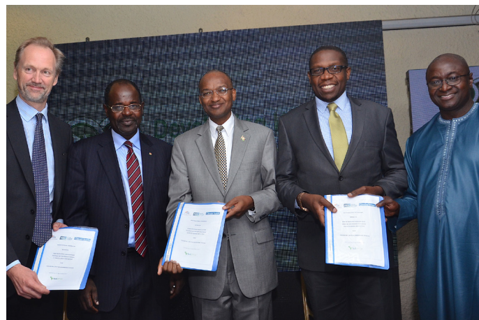
Photo from the launch of the Green Bonds Programme Kenya held at the Hilton Hotel, Nairobi, on 31 st March 2017

Once the studies are published, the programme will organise sector-specific workshops to publicise the findings and raise the profile of these green investment opportunities in Kenya. It is hoped that there may be further opportunity to expand and include other “green” sectors such as green affordable housing in future research pieces.