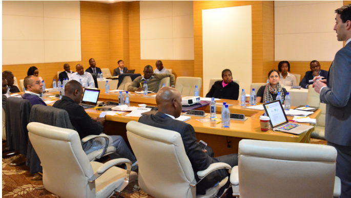
Green Bond portfolio review training held at Golden Tulip, westlands, Nairobi 26 th – 27 th June 2018.

Working with the CBI, the GBPK launched a training programme in June 2018 to equip Kenyan-based consultants to start the journey of becoming licenced verifiers. The training focused on green asset identification in line with the Green Bond Principles and the CBI Climate Bond Certification scheme as well as the development of a Green Bond Framework. Twenty-one delegates from a cross-section of the stakeholder community undertook the training. Following the training, four banks have expressed interest to participate in the green SPV. A timeline is being developed for consultants to work with these banks to generate a list of potential green assets to bring to the pool.