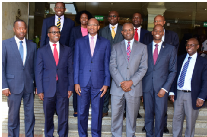
Photo from the Green Bond stakeholder consultation forum on the Development of the Green Bond Market in Kenya held at the Hilton Hotel, Nairobi, on 24 th May 2018

The programme organised and participated in six events designed to sensitise potential issuers about Green Bonds: a breakfast briefing with the NSE; a workshop with financiers and developers in the green building sector 6 ; an international learning session on the sovereign green bonds in France, sponsored by WWF and KBA; a peer international learning session between Turkiye Sinai Kalkinma Bankasi, a Turkish bank and Kenyan stakeholders, sponsored by the IFC; a peer international learning session between a regional bank based in Kenya and Yes Bank (India), sponsored by FMO; and a panel at the Bonds, Loans and Sukuk Conference. An important part of these peer learning sessions was leveraging international expertise and networks to promote local learning. The programme also engaged over twenty organisations with technical support for potential green bond issuance, and development of a pipeline of green bond issuers.